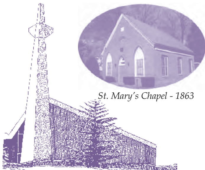
St. Mary's Chapel - 1863

Remember St. Mary, Fishkill, in your Will