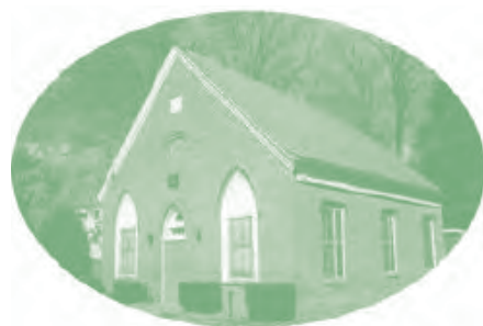
St. Mary's Chapel - 1863