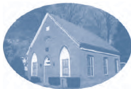
St. Mary's Chapel - 1863