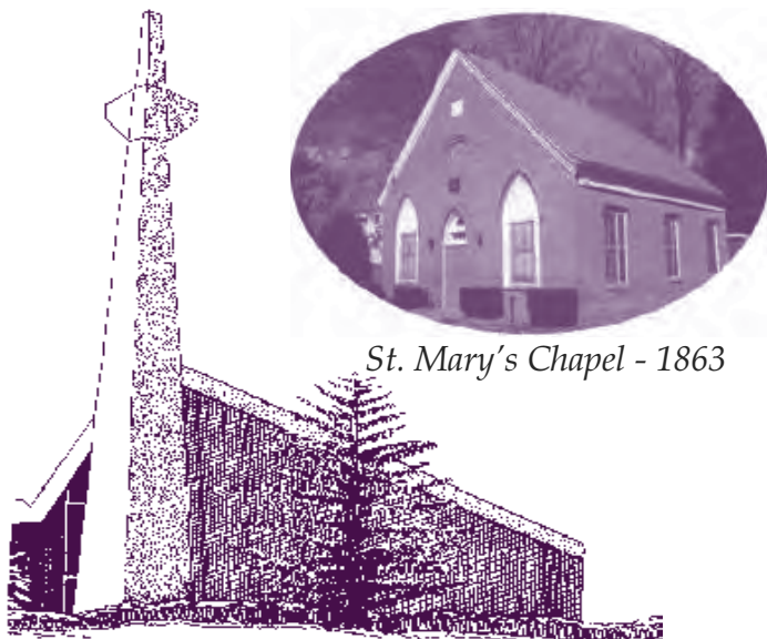
St. Mary's Chapel - 1863

Remember St. Mary, Fishkill, in your Will